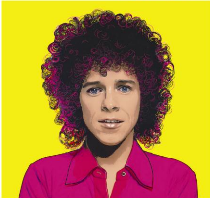
THE GREATEST HITS

It was in 1971 when Gerard Sayer made the decision to leave his career in commercial art and seriously follow his passion into the world of music and song writing. His manager's wife thought he looked like a lion with his incredible mane of curly hair. It was that moment that Gerard became Leo – Leo the lion – Leo Sayer.